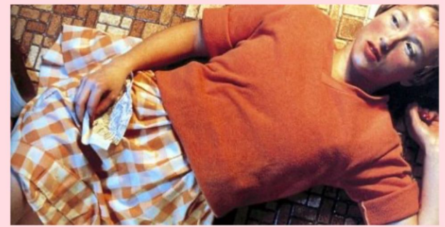
"The Centrefolds" - Cindy Sherman (1981) Reminiscent of centrefolds for men's erotic magazines, reclining figures pose baring varying states of emotion; some daydreaming, others terrified or angry